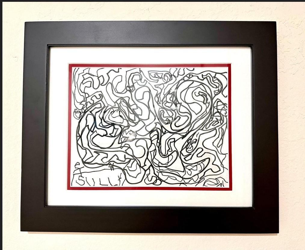
Trees from Space - Visual Art Sulley T. Kindergarten