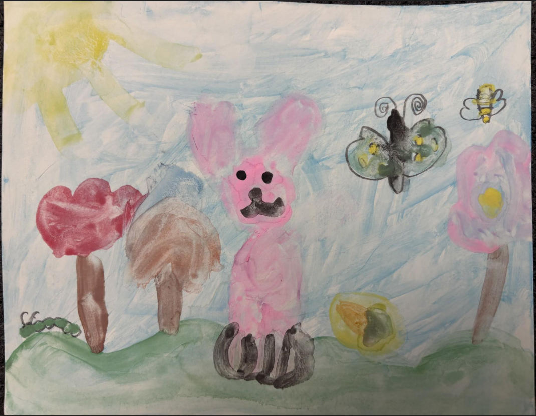
Bunny eating carrot in the garden - Visual Art Isabella M. 1st Grade