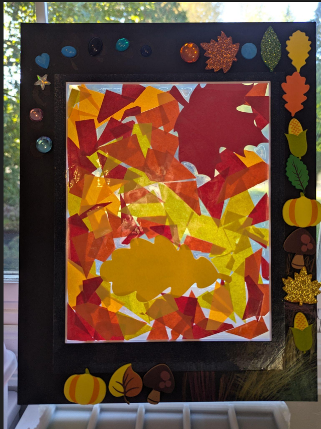
Fall on the Farm - Visual Art Amy K. Kindergarten