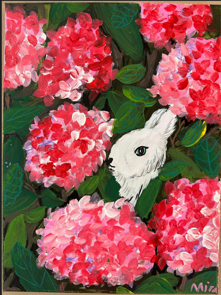
Bunny in the flower Mira Z. Kindergarten