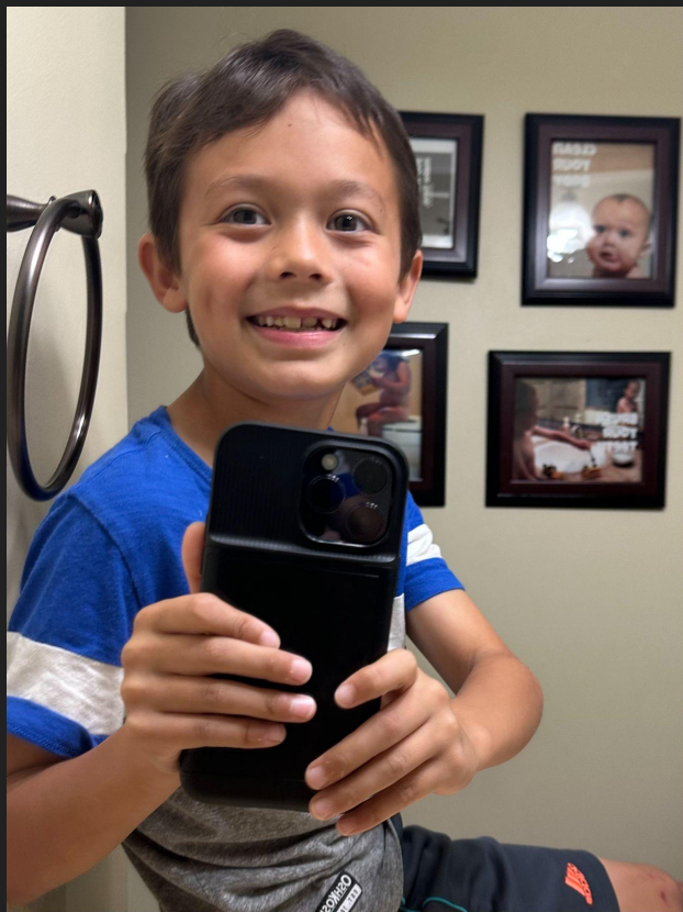
My Teeth - Photography Emmett S. 2nd Grade