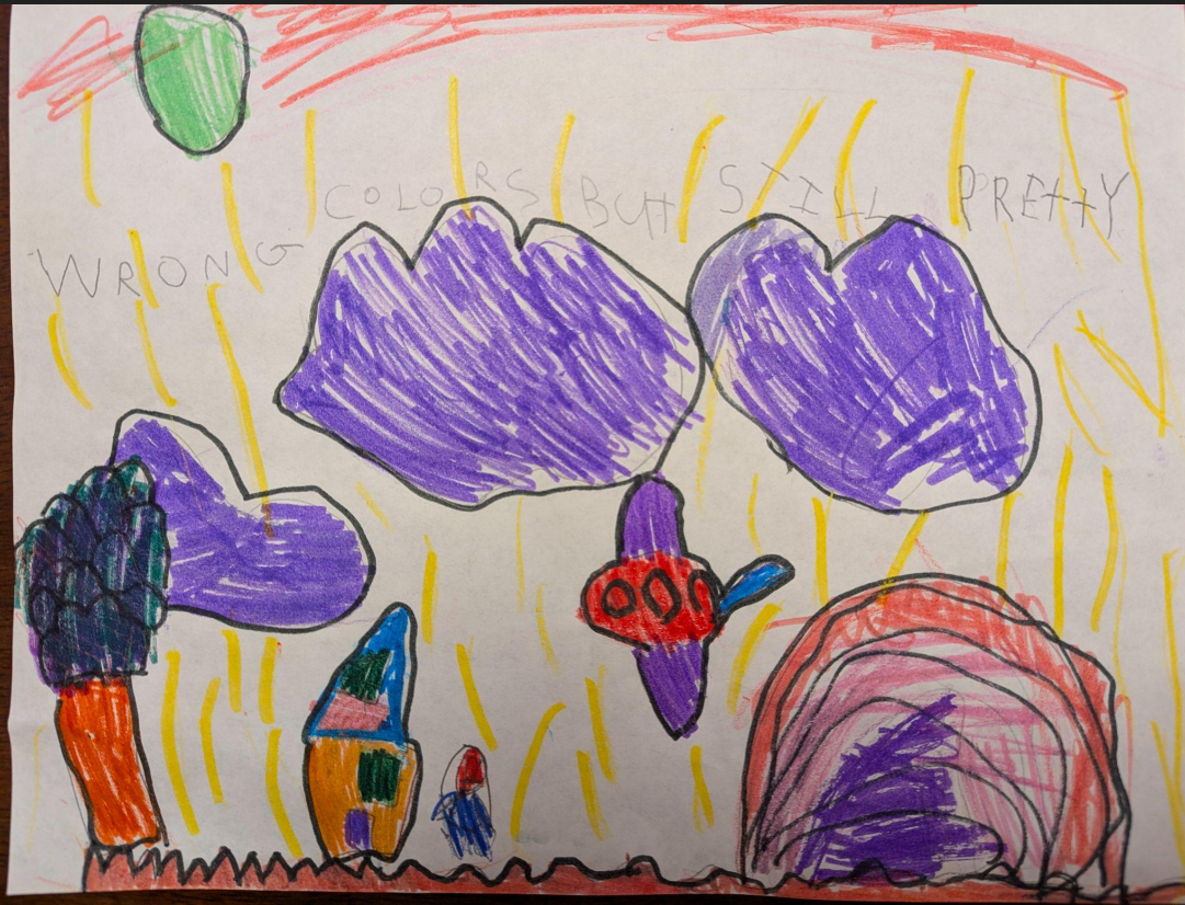
Wrong Colors - Visual Art Malia D. Kindergarten